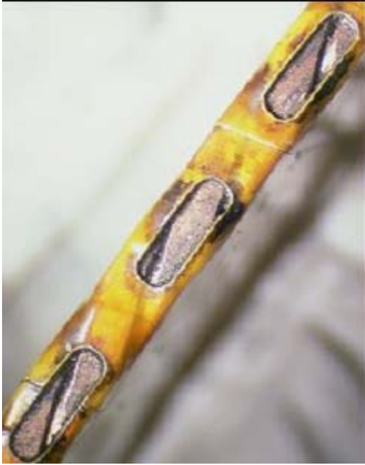
Figure 1. Cable inner edge.